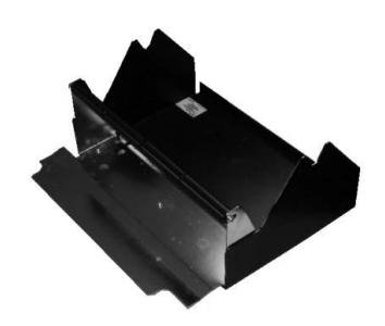
Media feeder tray

After opening the box, check that the following bundled items are all present. If anything is missing, inquire with the retailer, or dealer where this product was purchased.